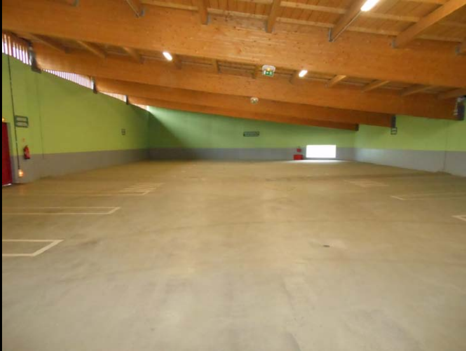
Upstare, 750m2 of covered parking.